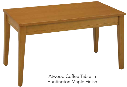
Atwood Coffee Table in Huntington Maple Finish